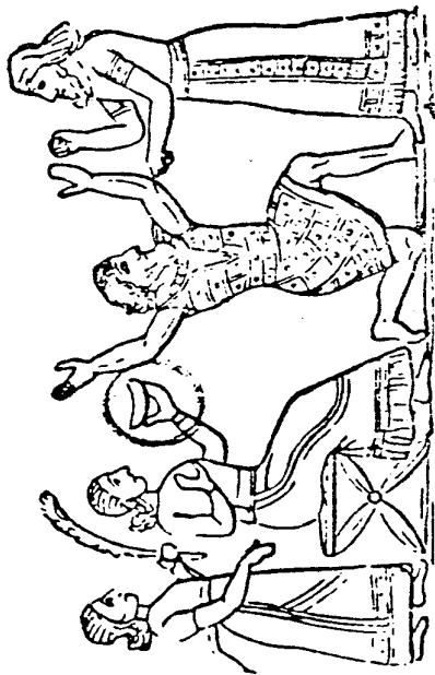
The woman with the cup from Babylon. From Kitto's Bible Encyclopedia.

Now compare this with the early history of the Papacy, and with spirit and modus operandi throughout, and how exact was the coincidence! Was it in a period of patriarchal light that the corrupt system of the Babylonian "Mysteries" began? It was in a period of still greater light that that unholly and unscriptural system commenced, that has found such rank development in the Church of Rome. It began in the very