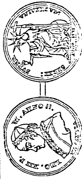
In 1825 Pope Leo XII struck a medal bearing his own image on one side and on the other that of the church of Rome symbolized as a woman holding in her left hand a cross and in her right hand a cup with this inscription. "Sedet super universum" - or in English "The World is her seat." Many considered this was announced in

In carrying out of this scheme, all knowledge, sacred and profane, came to be monopolised by the priesthood, who dealt it out to those who were initiated in the "Mysteries" exactly as they saw fit, according as the interests of the grand system of spiritual despotism they had to administer might seem to require. Thus the people, under the Babylonian system, were bound neck and heel to the priests. The priests were the only deposi-